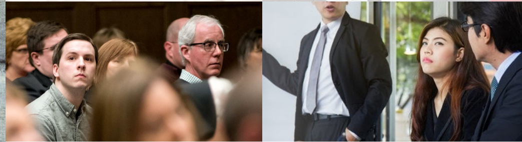
Don't listen well