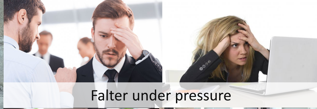
Falter under pressure