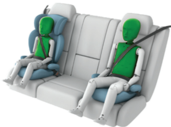
6 YEAR OLD