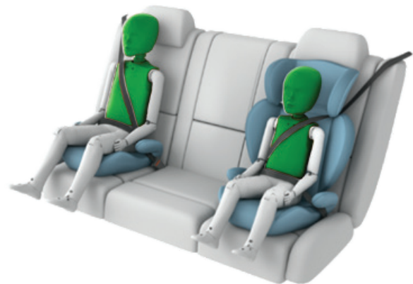
10 YEAR OLD