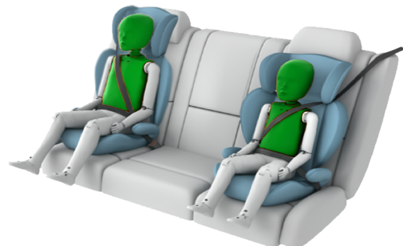
10 YEAR OLD