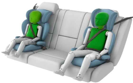
6 YEAR OLD